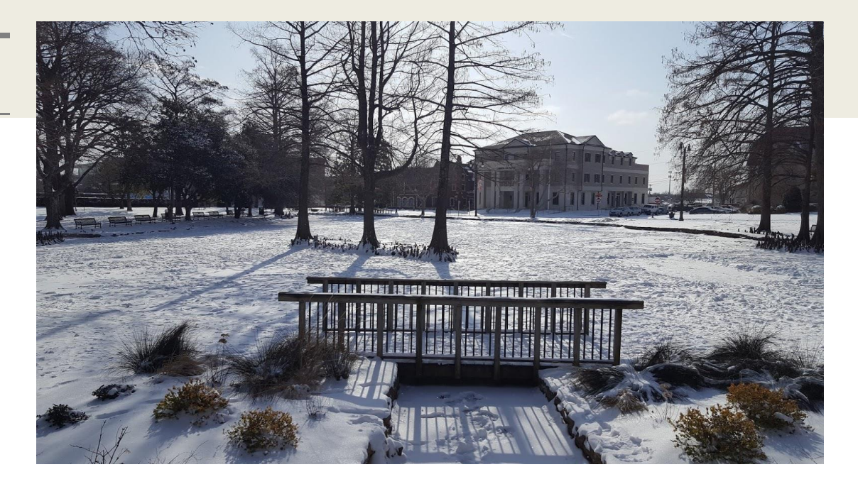
Cold Beginnings: Theta Pond Frozen