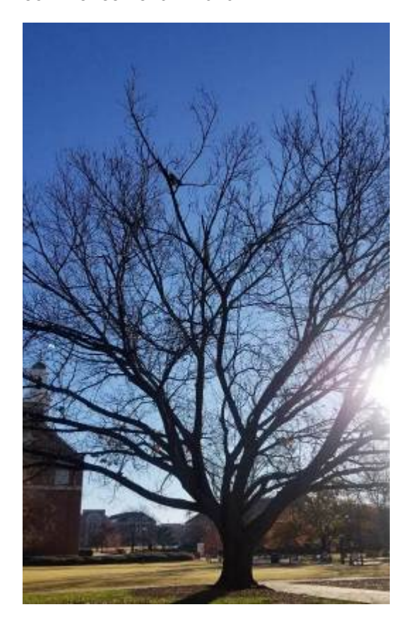
Oak tree outside of Life Science East. The tree sustained minor damage in an early season ice storm.