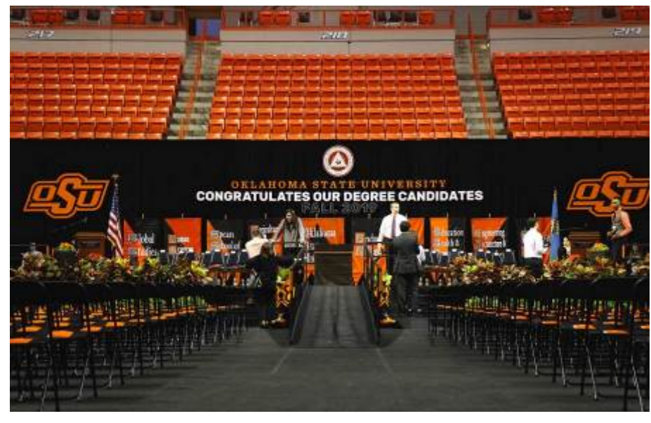
Preparations for the 2019 fall commencement.