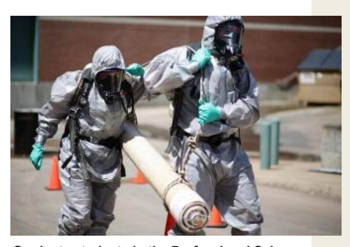
Graduate students in the Professional Science Master's program are trained and certified to deal safely with hazardous waste.