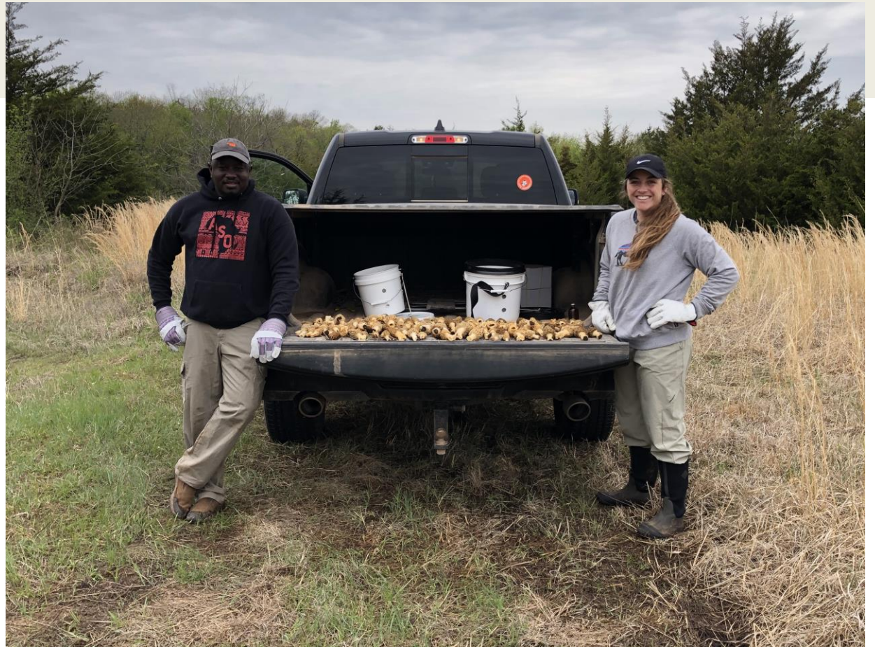
More morel mushrooms