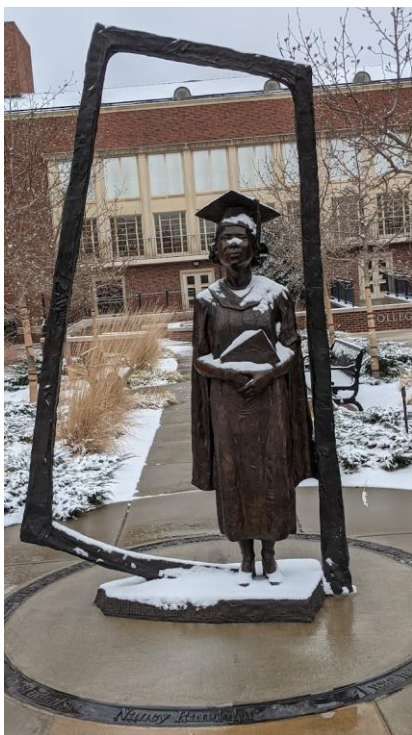
We had our fair share of snow days this spring!